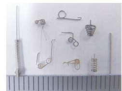
Torsion spring parts formed on SH-311

Applying an assist tool and a cutting tool symmetrically expands work range and gives speedup of production