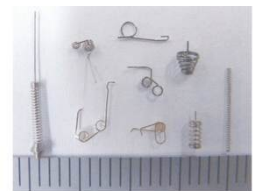
Torsion spring parts formed on SH-311

Applying an assist tool and a cutting tool symmetrically expands work range and gives speedup of production