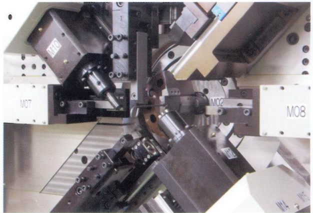
Upper/Lower tables travel 40mm from side to side Quill travels 60mm back-and-forth