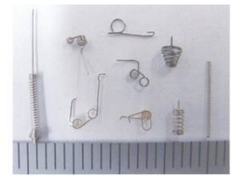
Torsion spring parts formed on SH-311

Applying an assist tool and a cutting tool symmetrically expands work range and gives speedup of production